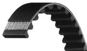
CURVED LINEAR ALTERNATOR / TIMING BELT