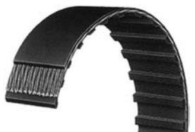
SYNCHRO LINK ALTERNATOR / TIMING BELT